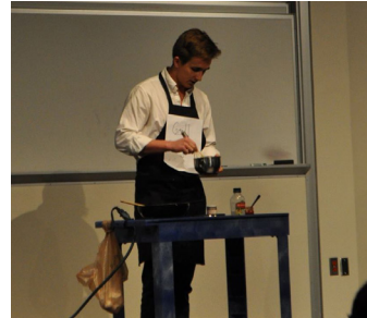
1st place Greek God performance