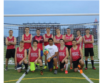
Intramural soccer team