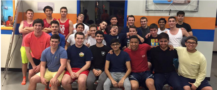
A recent brotherhood trip to skyzone