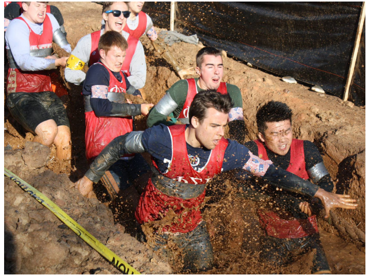
Brothers participating in tug