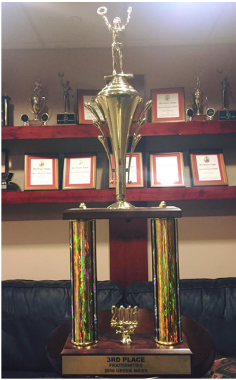
3rd place Greek week trophy!