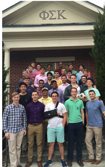
Supporting DV Awareness