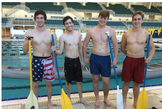
1st place Orion's Boat team

Homecoming weekend falls on October 27 through October 29 this year, with Semi-Formal on Friday the 28th, and the Duke game on Saturday the 29th. The time of the game is not released yet, but we will be having our annual alumni lunch a few hours before the game. We are hoping to beat our standing last year, which was fourth of the thirty two IFC fraternities.